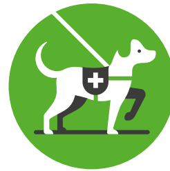
Aids and equipment