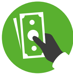
Income and finance

The Disability Gateway can help us to find out about employment, housing, income and finance, transport and more.