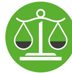
Rights and Legal