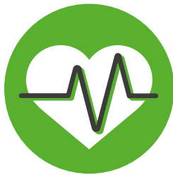
Health and wellbeing